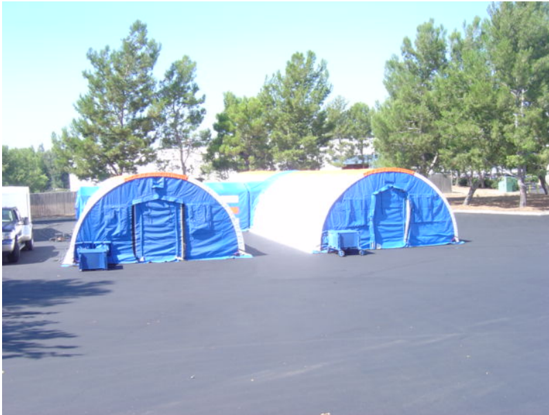
This picture is from a set-up demonstration of the tent structure mobile hospital.