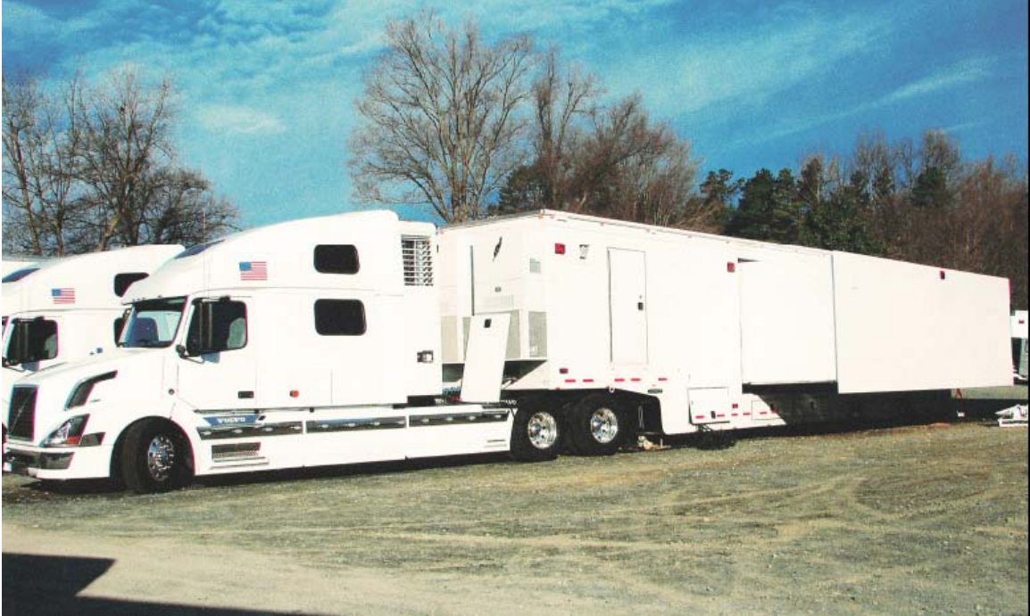
Image of tractor-trailers